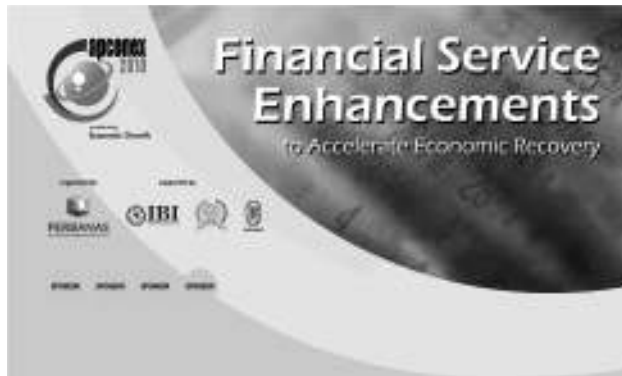
WALL BANNER (4 x 6 m)