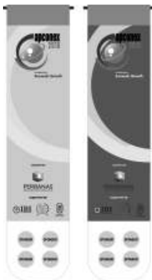
ROLL-UP BANNER (80 x 200 cm)